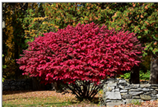
Winged Burning Bush in fall