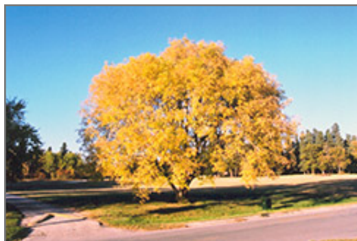
Boxelder in fall