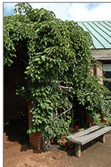
Geneva Hardy Kiwi