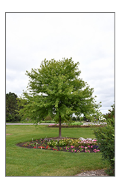
Sienna Glen Maple