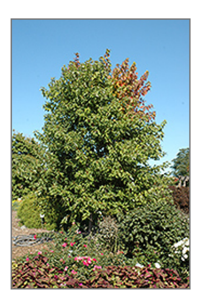
Sienna Glen Maple