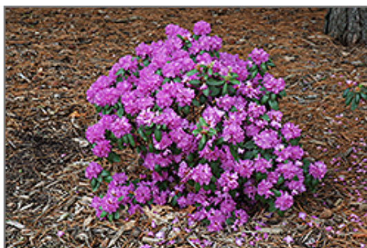
Compact P.J.M. Rhododendron in bloom