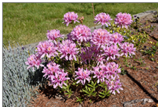
Orchid Lights Azalea in bloom