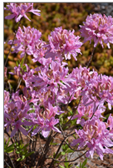
Orchid Lights Azalea flowers