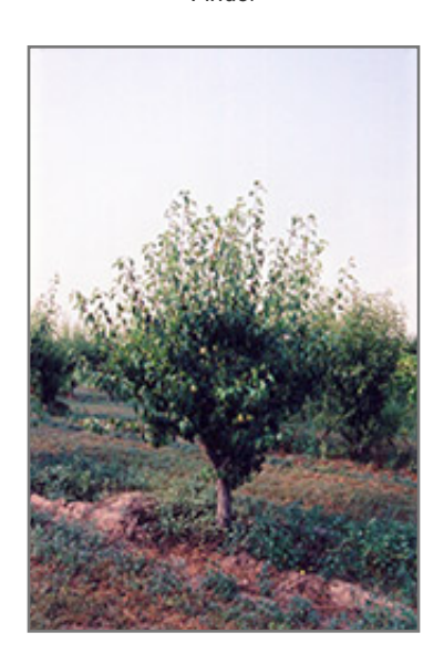
Anjou Pear