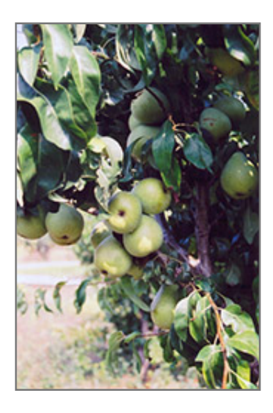
Anjou Pear fruit

Anjou Pear is bathed in stunning clusters of white flowers with purple anthers along the branches in early spring. It has forest green deciduous foliage. The glossy pointy leaves turn an outstanding deep purple in the fall. The fruits are showy green pears with a red blush, which are carried in abundance in early fall. The fruit can be messy if allowed to drop on the lawn or walkways, and may require occasional clean-up.