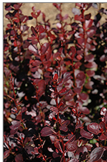
Rosy Rocket Barberry foliage