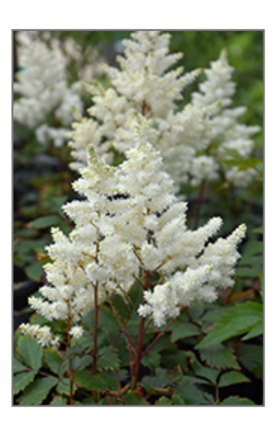
Younique White Astilbe flowers

Feathery, elegant white plumes, rise above dense foliage; best in a shady spot with dappled light; prefers moisture so water regularly for abundant flowers and nice foliage; perfect for mixed containers; plume heads can be left for winter interest