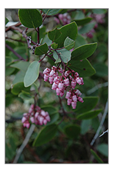
Greenleaf Manzanita flowers