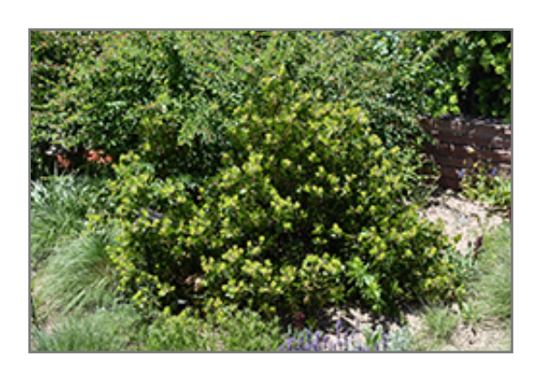
Greenleaf Manzanita

This shrub does best in full sun to partial shade. It is very adaptable to both dry and moist growing conditions, but will not tolerate any standing water. It is very fussy about its soil conditions and must have sandy, acidic soils to ensure success, and is subject to chlorosis (yellowing) of the foliage in alkaline soils, and is able to handle environmental salt. It is somewhat tolerant of urban pollution. This species is native to parts of North America.