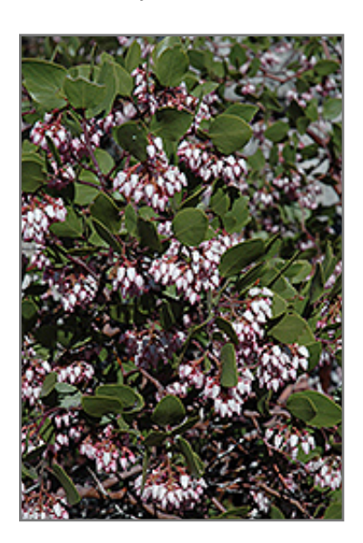
Greenleaf Manzanita in bloom