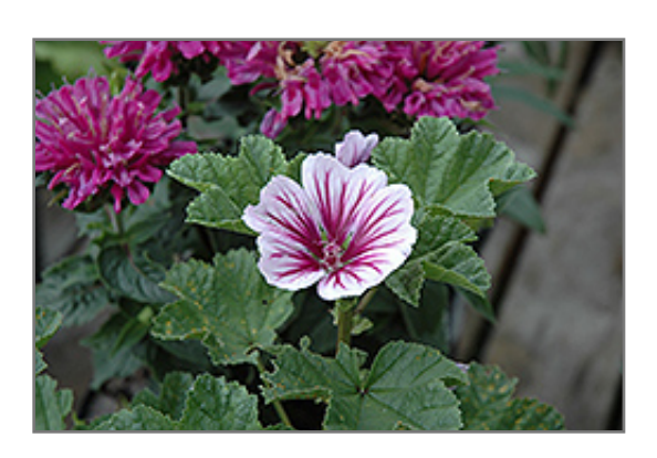
Summer Carnival Hollyhock flowers