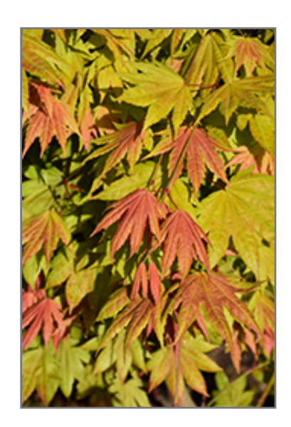
Moonrise Full Moon Maple foliage

Moonrise Full Moon Maple will grow to be about 30 feet tall at maturity, with a spread of 30 feet. It has a low canopy with a typical clearance of 4 feet from the ground, and is suitable for planting under power lines. It grows at a slow rate, and under ideal conditions can be expected to live for 60 years or more.