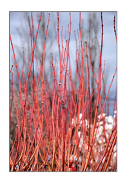
Pacific Fire Vine Maple stems