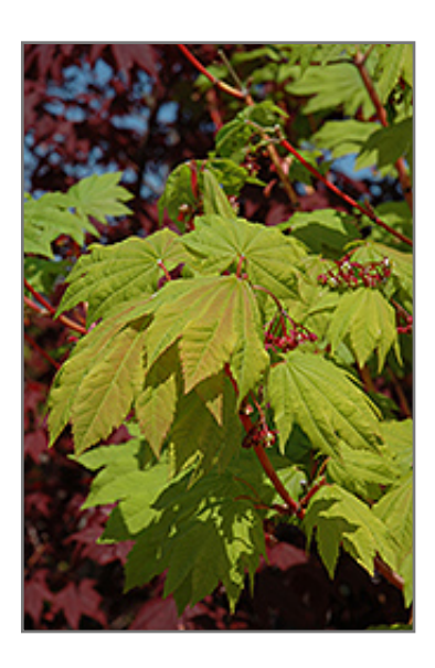
Pacific Fire Vine Maple foliage

Pacific Fire Vine Maple will grow to be about 10 feet tall at maturity, with a spread of 10 feet. It has a low canopy with a typical clearance of 1 foot from the ground, and is suitable for planting under power lines. It grows at a fast rate, and under ideal conditions can be expected to live for 60 years or more.