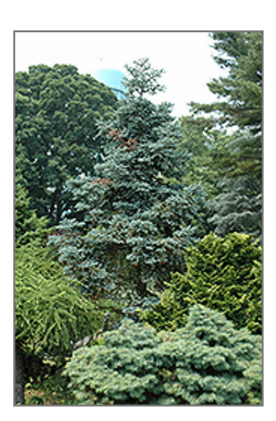
Dwarf Noble Fir

A slow growing and compact variety with long sweeping branches and stunning blue-green dense foliage that has a silvery hue; bark on young trees is grey and smooth but becumes red-brown, rough and fissured with age