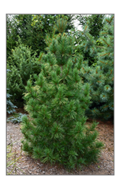
Columnar White Pine

Columnar White Pine will grow to be about 25 feet tall at maturity, with a spread of 8 feet. It has a low canopy with a typical clearance of 3 feet from the ground, and is suitable for planting under power lines. It grows at a fast rate, and under ideal conditions can be expected to live to a ripe old age of 100 years or more; think of this as a heritage tree for future generations!