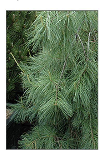
Weeping White Pine foliage