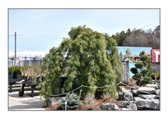
Weeping White Pine