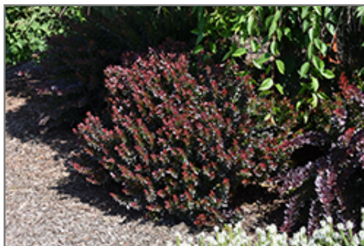
Midnight Ruby Barberry