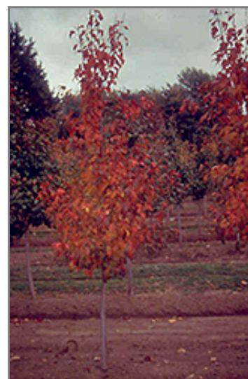
Beethoven Amur Maple in fall