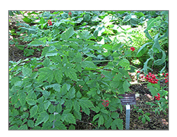
Rattlesnake Fern

This is a common native fern whose clustered sporangia resembles a snake's rattle; prefers moist, shady areas; great for a woodland garden or along shaded borders