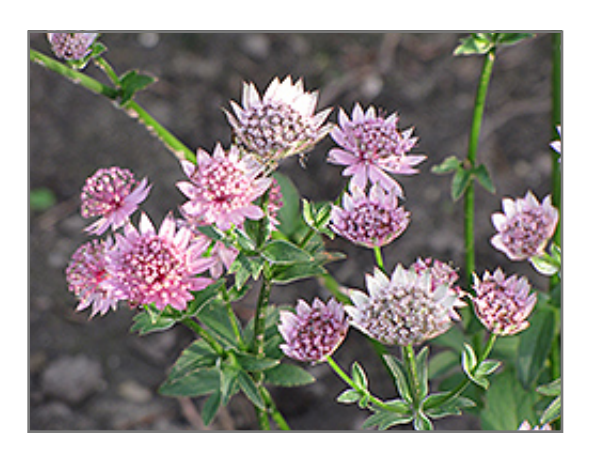
Primadonna Masterwort flowers

Primadonna Masterwort is recommended for the following landscape applications;