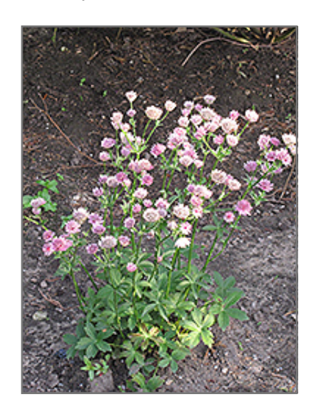
Primadonna Masterwort in bloom