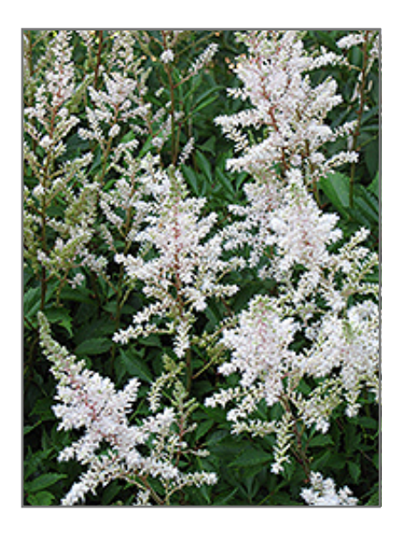
Ceres Astilbe flowers

Elegant shell pink colored plumes rising above deep green leaves; perfect in a shady spot with dappled light; prefers moisture so water regularly for abundant flowers and nice foliage