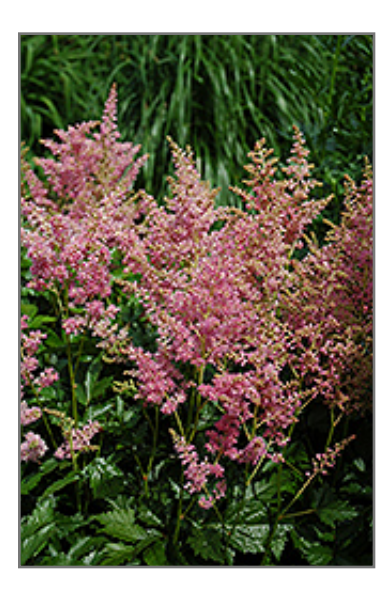
Amethyst Astilbe flowers

Lovely lilac-mauve colored plumes rising above lacy delicate leaves; perfect in a shady spot with dappled light; prefers moisture so water regularly for abundant flowers and nice foliage