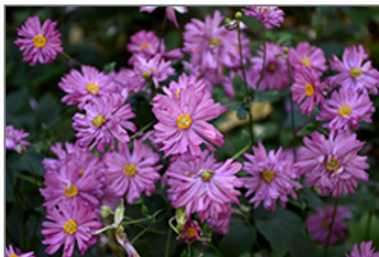
Prince Henry Anemone flowers