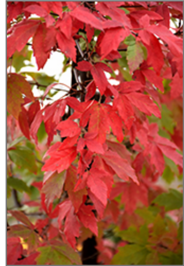
Paperbark Maple in fall

This tree does best in full sun to partial shade. It prefers to grow in average to moist conditions, and shouldn't be allowed to dry out. It is not particular as to soil type or pH. It is somewhat tolerant of urban pollution. This species is not originally from North America.