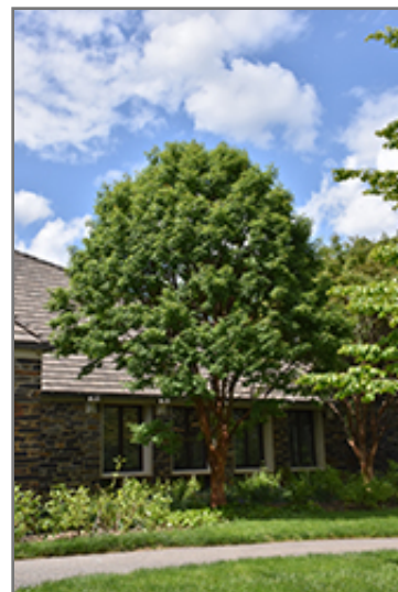
Paperbark Maple

Paperbark Maple will grow to be about 30 feet tall at maturity, with a spread of 25 feet. It has a high canopy with a typical clearance of 6 feet from the ground, and should not be planted underneath power lines. As it matures, the lower branches of this tree can be strategically removed to create a high enough canopy to support unobstructed human traffic underneath. It grows at a slow rate, and under ideal conditions can be expected to live for 80 years or more.